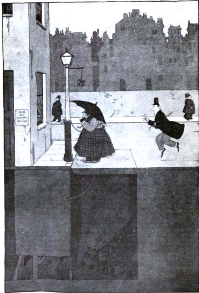
TAKING A CRUEL ADVANTAGE OF THE MISTLETOE BOUGH.

Art by W. Heath Robinson (1872-1944) The Strand Magazine December 1922